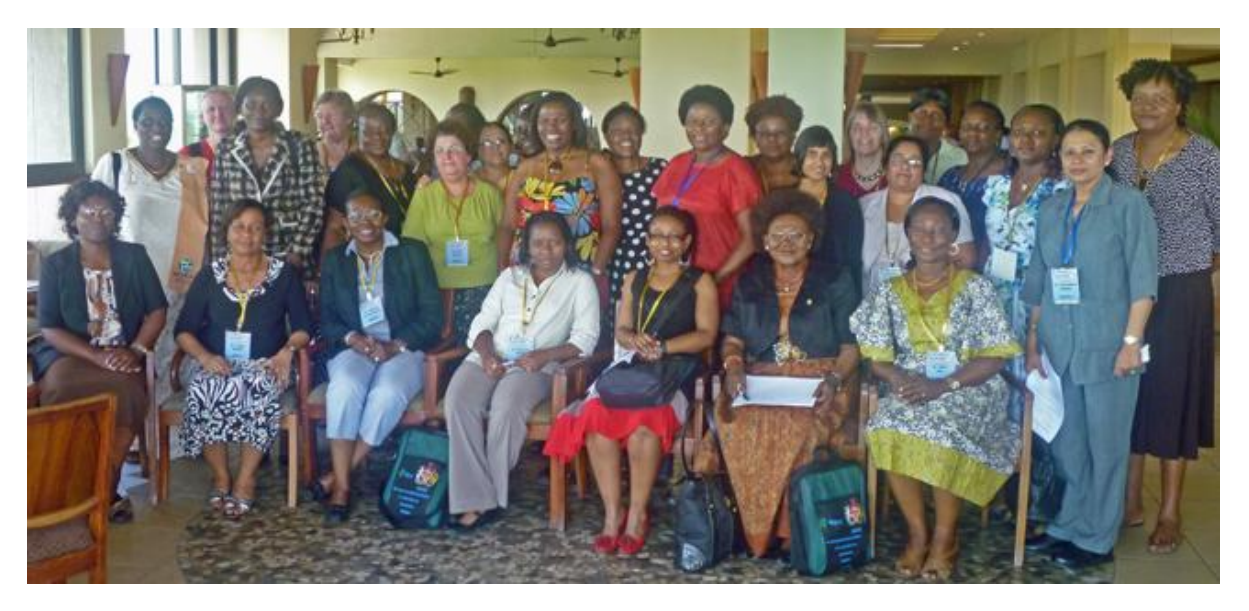
WONCA women get together at the conference