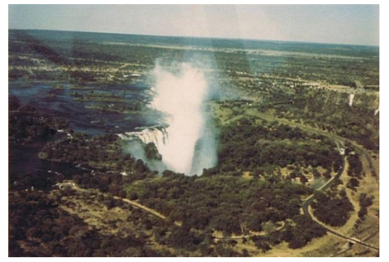
Victoria Falls - wet and dry season views

communal sharing and ingenious improvisation to offset limited resources all position Africa to be a dynamic and global leader in the future. I also believe that similar advances will happen in African health care. Limited resources force countries to focus on priorities and address important needs. In contrast, clinical service and research agendas in high income countries often lose creativity, flexibility, and relevance as they get tangled up in excessive bureaucracies, entrenched interests, and wasteful practices.